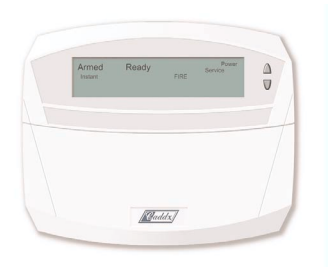
FIXED DISPLAY WITH REMOVABLE DOOR