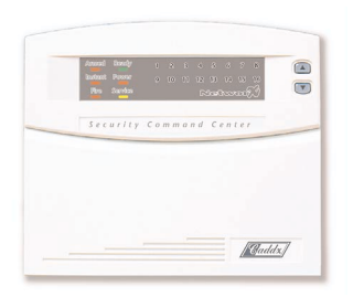
LED WITH REMOVABLE DOOR