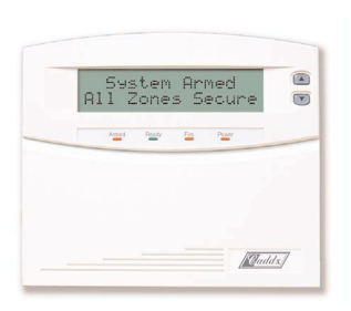
LCD WITH REMOVABLE DOOR